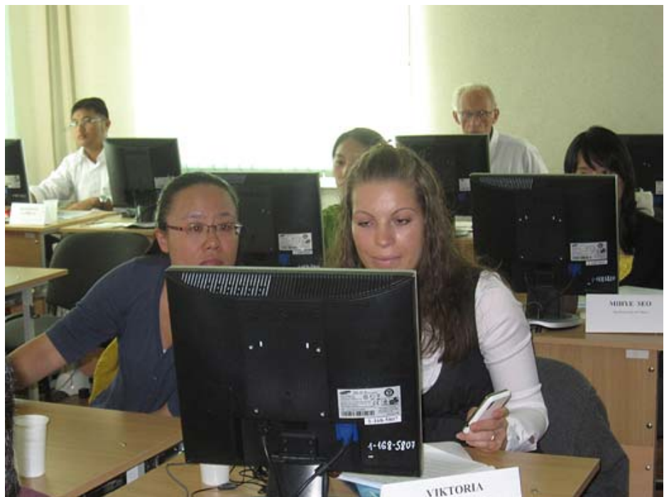
Snapshots during the hands on practice